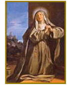
St. Margaret of Cortona